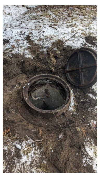
Sewer manhole at the dead end of Birchington Court.

January 3 – FVOP staff found a sewer manhole lid had been struck by a plow in the Wyndham Gardens neighborhood. FVOP staff dug around the manhole and returned the lid and collar to the correct positions. FVOP staff then installed yellow driveway markers in front of the manhole to help prevent further issues.