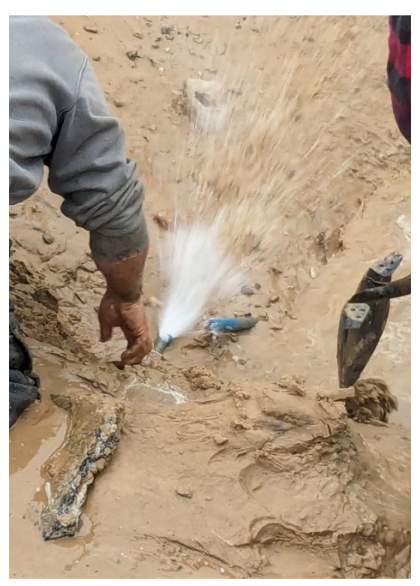
Water leak at 101 Kelly Drive.

January 16 – FVOP staff were called out to 3279 US-23 South for an emergency turn off. The heat was off in the home and the water lines were frozen. FVOP staff found that the curb-box was bent over and inaccessible. Staff scheduled MacArthur Construction to replace the broken curb-box.