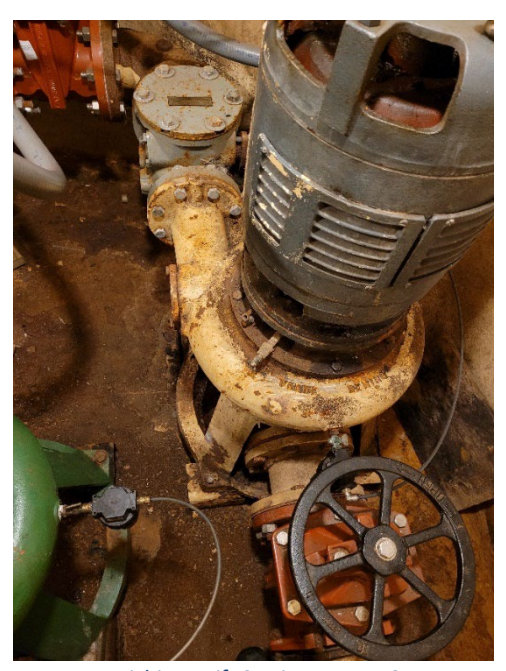
Michigan Lift Station pump #2

January 8 - FVOP staff pulled pump #2 at the Michigan Lift Station and found that the pump was seized. FVOP staff took pictures and recorded information from the pump name plate in order to obtain quotes for replacement. Pumps #1 and #3 were replaced in the last few years, and pump #2 was the only remaining original pump.